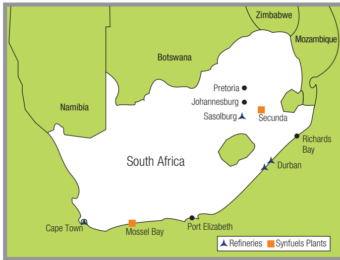
Figure 2 South African refineries

The international price of petrol is mostly a factor of supply and demand and of course the price of crude oil also plays a major role. Since crude oil is the major input cost for a crude oil refinery it is inevitable that crude oil cost will also impact the price of the refined product at the end of the day. For example, if crude oil prices increase it follows that the price of fuel will also increase to enable crude oil refiners to cover their costs. Also, since international prices are quoted in US$, the Rand/US$ exchange rate will always be a determining factor of the local fuel prices. For example if there is a weakening of the Rand/US$ exchange rate it will mean that there will be an increase in the domestic price of petrol.