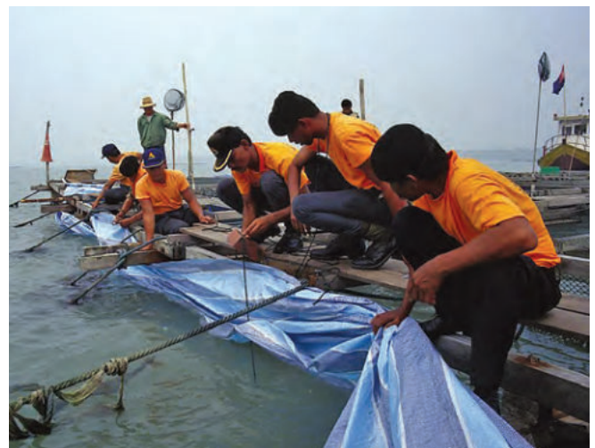
▲ Figure 13: With sufficient notice, weighted plastic sheeting can be suspended around fish cages in an attempt to prevent contamination by floating oil.