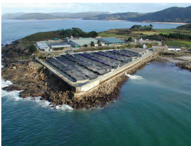
▲ Figure 7: Onshore fish hatcheries require large volumes of clean sea water. Water intakes are usually located below the water surface and may be affected by dispersed oil.

At lower concentrations, laboratory studies have demonstrated that exposure of test species to the more toxic components of oil can result in impairment of various physiological functions, such as respiration, movement and reproduction, and can increase the likelihood of genetic mutations in eggs and larvae. However, not only is it difficult to detect such sub-lethal effects in the field but the widespread impact on stocks, which might be predicted by extrapolation of the laboratory results to the field, has not been observed. Similarly, despite mortality of eggs and larvae which may occur following a spill, subsequent depletion of adult wild stocks is very rarely recorded. In part, this can be explained by the considerable natural resilience of marine ecosystems to a variety of acute impacts. Marine organisms readily adapt to naturally high mortalities, inter alia by the production of vast surpluses of eggs and larvae and recruitment from stock reservoirs outside the affected area.