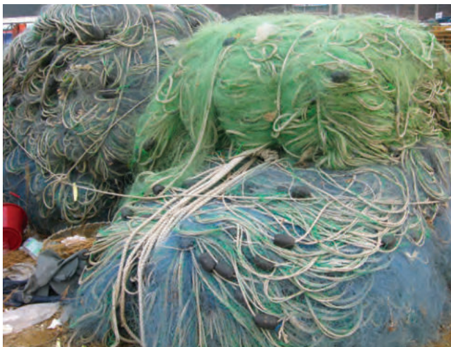
▲ Figure 5: Oiled fishing nets and pots may be cleaned, provided they are not too heavily fouled. However, in some instances, replacement may be more economically viable.