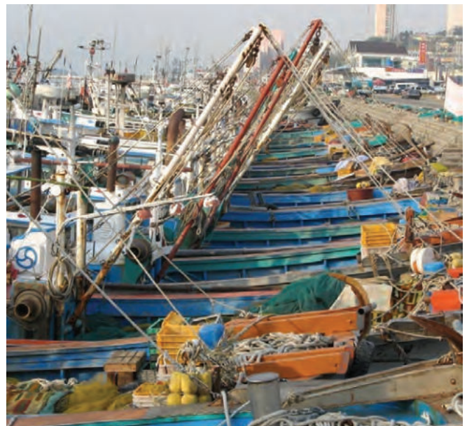
▲ Figure 1: Fishing fleets can be affected by spilled oil, either as a result of contamination of vessels and gear or by fishing bans, both of which may force them to remain in port.

The greatest impact is likely to be found near-shore, where animals and plants may be physically coated and smothered by oil or directly exposed to toxic components over extended periods of time. For this reason, sedentary species, such as