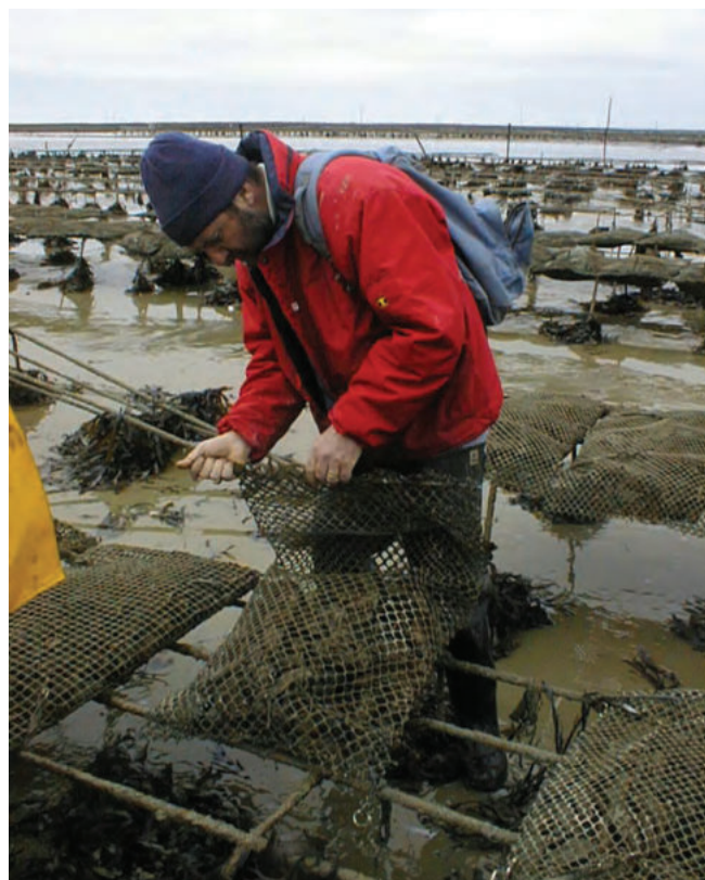
▲ Figure 16: Collecting oyster samples for analysis – the minimum number of samples to obtain reliable results needs to be determined on a case-by-case basis.

Samples of animal and plant tissue are perishable and must be collected and stored appropriately to preserve their integrity. Clean storage containers should be used (preferably glass) to avoid spoilage and cross-contamination of samples. Chilling or freezing is the most convenient conservation method for counteracting the microbial decomposition of samples in the short term. Collected samples should be sealed, labelled and quickly placed in an insulated container with a suitable refrigerant pack ready for transport to the analytical laboratory or to a freezer facility for longer term storage. It should be recognised that under some analytical protocols even frozen samples become invalid after long periods of storage.