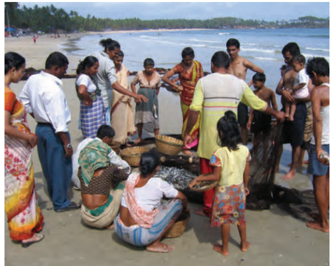
▲ Figure 3: Small coastal communities often rely on fishing for income and subsistence and can be severely affected as a result of an oil spill.

As a consequence, the sensitivity of a species or activity to spilled oil is also seasonally dependent. For example, some of the larger seaweeds grown in Asia are harvested in the spring or early summer and the next generation is not planted out until early autumn. Other faster growing species may have several plantings and harvests throughout the year. The rearing of larvae in onshore tanks supplied with water piped from the sea is similarly seasonal and does not generally extend beyond a few months in any year.