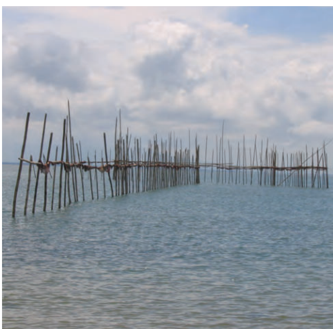
▲ Figure 6: Fish traps are susceptible to contamination by floating oil.