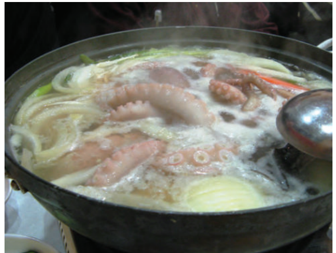
▲ Figure 9: Seafood is an important protein source for many communities.

The occurrence of contamination in seafood organisms or products following a major spill can lead to public health