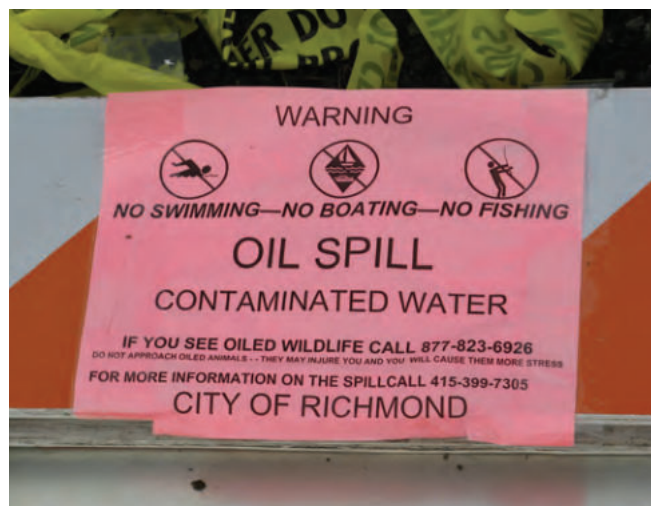
▲ Figure 15: Fishing restrictions may be imposed to protect public health and to prevent contaminated produce reaching markets after an oil spill.

For shore tanks, ponds or hatcheries, temporary suspension of water intake and re-circulation of the water already within the system may be effective to isolate stock from the threat of oil contamination. Closing sluice gates to prawn ponds, for example, can also afford short-term protection. Suspension of feeding may offer an option to avoid farmed fish and other cultivated stock coming into contact with contaminated feed if food would otherwise be distributed through a surface film of oil. The reduction or suspension of feeding has the additional advantage that the loading of waste products in the re-circulated water is reduced, but care must be taken