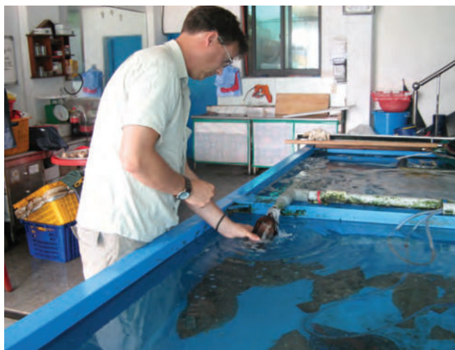
▲ Figure 18: Collection of water samples in an enclosed onshore farm. Analysis may indicate the potential for contamination of stock.