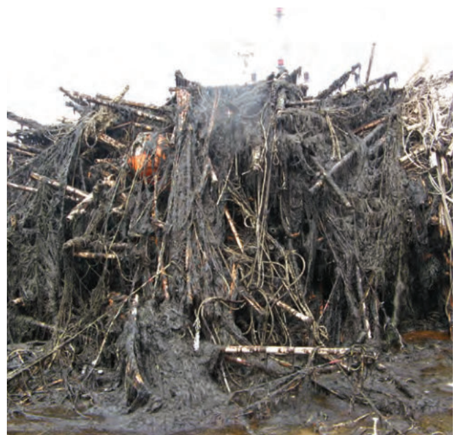
▲ Figure 12: Seaweed cultivation racks heavily contaminated with oil. These could not be cleaned to a satisfactory standard and were therefore dismantled and replaced with new structures.