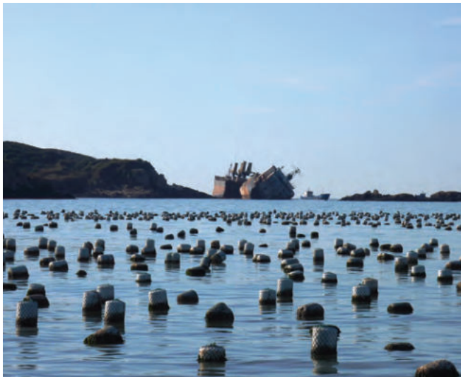
▲ Figure 2: A seaweed farm – fisheries and mariculture are often susceptible to oil spills.