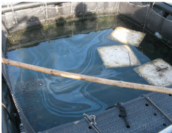
▲ Figure 14: An oiled abalone farm. Sorbent pads, though inappropriate for bulk oil removal, are often useful for removing sheen from inside fish cages.

bulk oil, they are often useful for removing thin oil films from water surfaces in tanks and cages (Figure 14). Sorbent materials have also been used successfully to filter sea water for onshore facilities. In all cases, it is important to replace oiled sorbents to avoid them becoming a source of secondary pollution. Loose particulate sorbent should not be used, as this can be mistaken for feed.