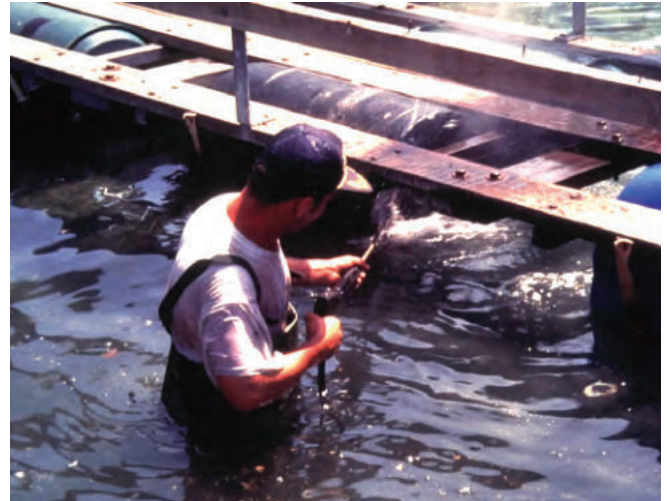
▲ Figure 11: Mariculture facilities can be cleaned in-situ by pressure washing.

Although sorbents are not appropriate for the removal of