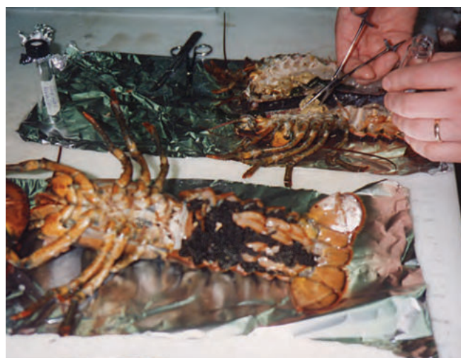
▲ Figure 17: Fish and shellfish are usually steamed prior to sensory testing. After cooking, these lobsters have been opened and the white meat will be tested for taint by smell and taste.