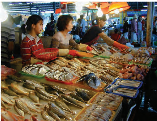
▲ Figure 10: Fish for sale – the interruption of commercial fishing activity can have important economic consequences throughout the sales chain, from landing ports to retailers, such as this market stall.

Guidance values have been established based on the sum of these 16 priority PAHs following spills. However, since PAHs form a complex mixture of thousands of compounds, 'total PAH' is often used as a measure of contamination. Total PAH is, however, often difficult to interpret, since it will depend on the nature of the particular components that have been added together to obtain the global figure. For this reason, the identities of the actual PAHs analysed should be specified to allow an evaluation of contamination levels based on a comparison of like-with-like.