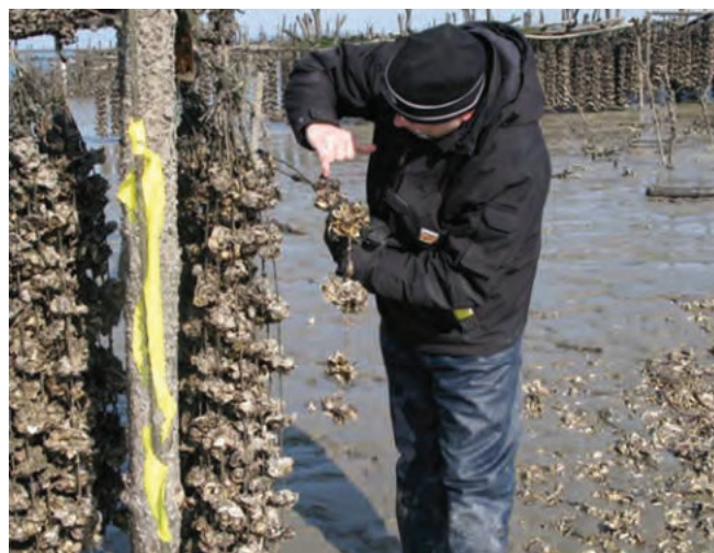
▲ Figure 19: Procedures for monitoring the levels of contamination, as with these oysters, should be included in contingency plans to avoid unnecessary fishery closures.

The taint-free threshold can be defined as the point at which a representative number of samples from the polluted area are found to be no more tainted than an equal number of samples from a nearby control area or commercial outlet outside the spill zone. This approach takes account of the fact that there may be variation between individual testers and consumers and that in any population tainted samples may occur for reasons other than an oil spill. The confidence in accepting that the fish or shellfish are clean and safe comes from an adequate time-series of monitoring data showing the progressive reduction in taint following a spill ( Figure 8 ).