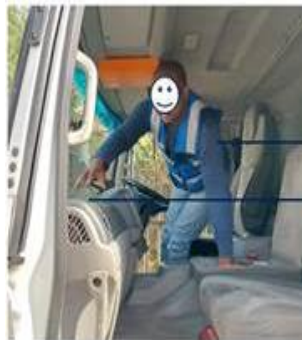
Passenger side view